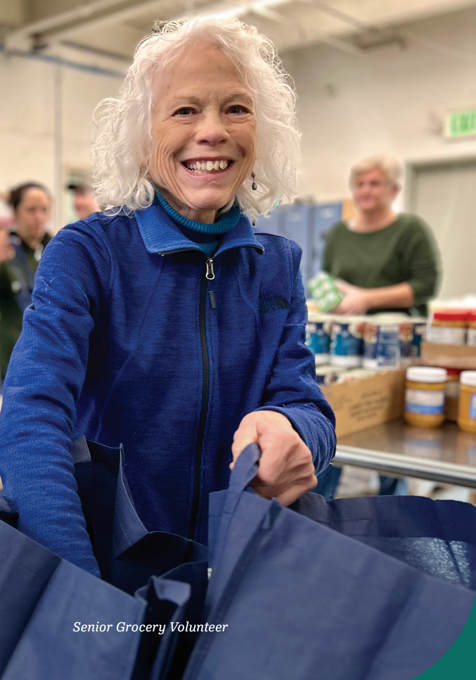
Senior Grocery Volunteer