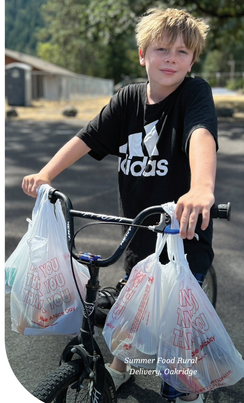
Summer Food Rural Delivery, Oakridge