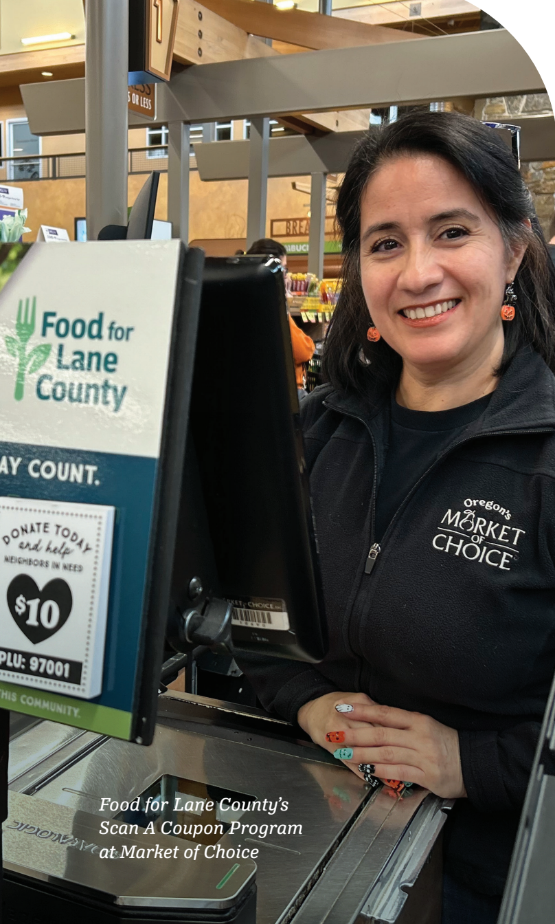
Food for Lane County's Scan A Coupon Program at Market of Choice