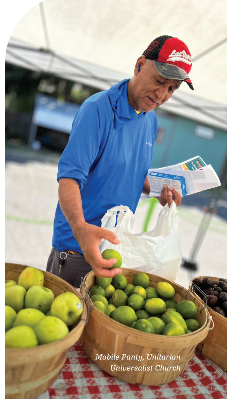
Mobile Pantry, Unitarian Universalist Church

Your donations made it possible for us to respond quickly to the SNAP crisis. But that's not the whole story. This November and December, in