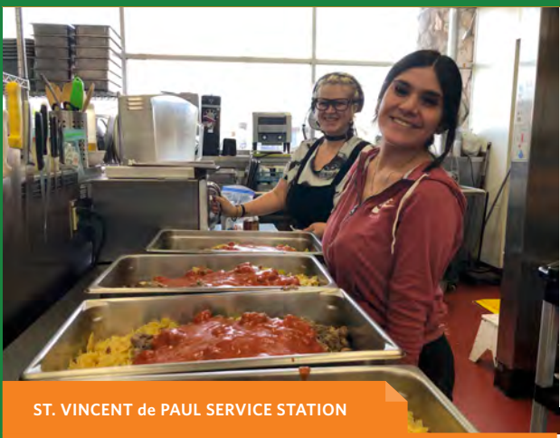
ST. VINCENT de PAUL SERVICE STATION