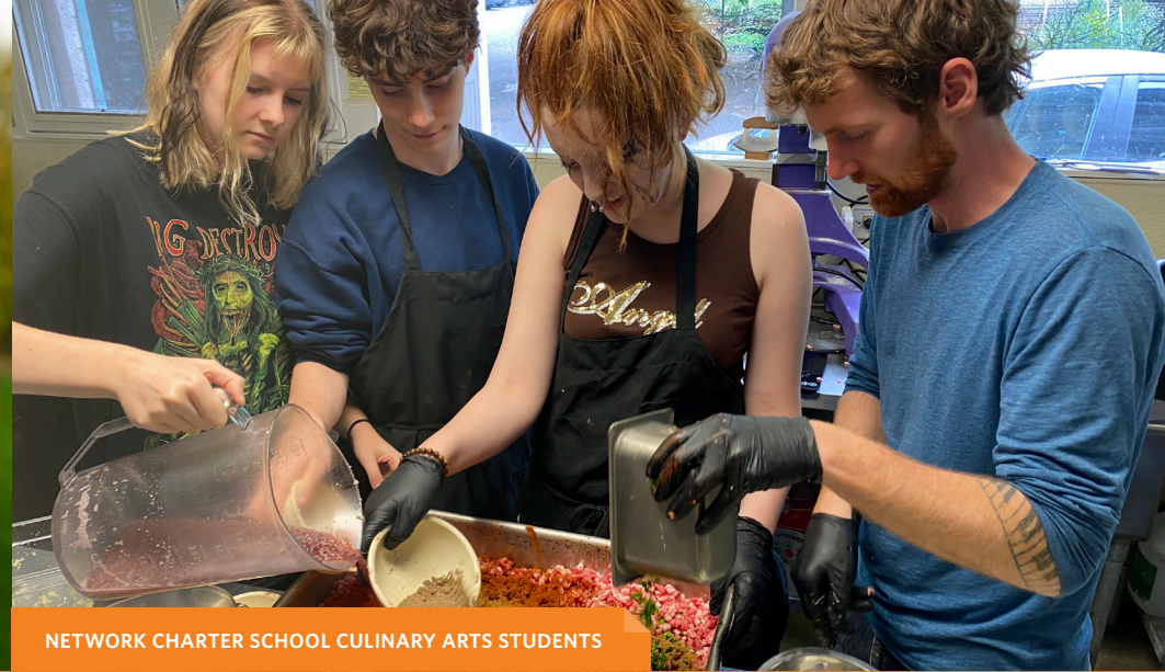
NETWORK CHARTER SCHOOL CULINARY ARTS STUDENTS