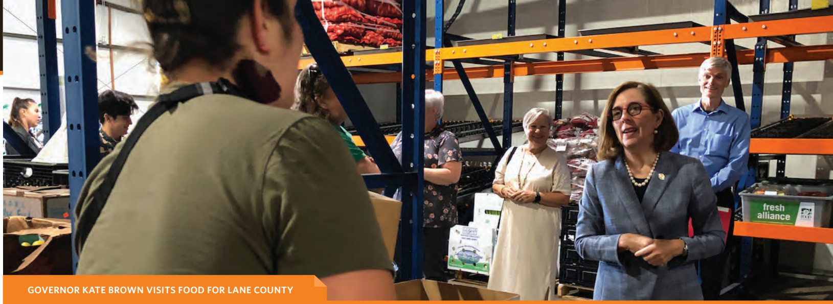
GOVERNOR KATE BROWN VISITS FOOD FOR LANE COUNTY