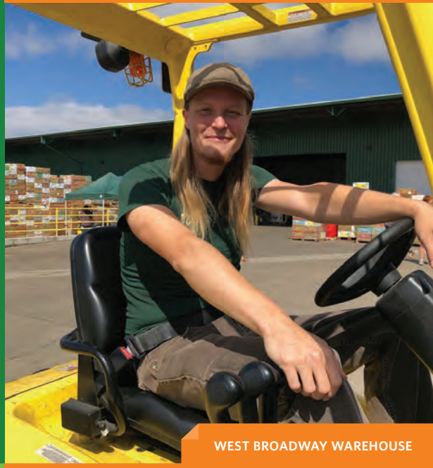
WEST BROADWAY WAREHOUSE