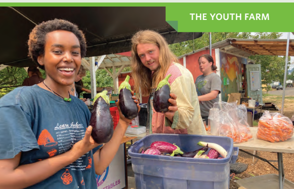
THE YOUTH FARM

High costs of food, gas and other necessities are causing real hardship for families living on limited incomes in Lane County. Your neighbors need your help. Please join us as we work to increase food access through our partner agency network and direct service programs.