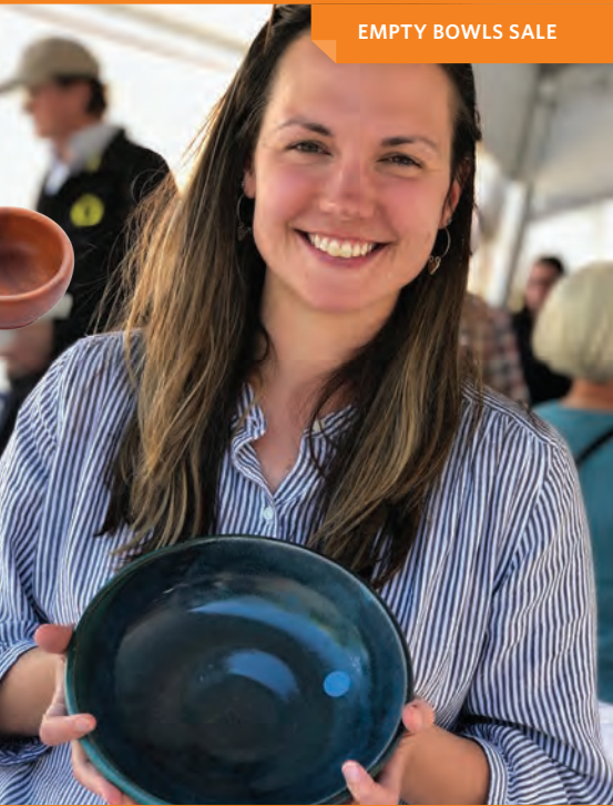
EMPTY BOWLS SALE

FRIDAY, MAY 6 4:30pm-7:30pm The Dining Room 270 W. 8th Ave., Eugene