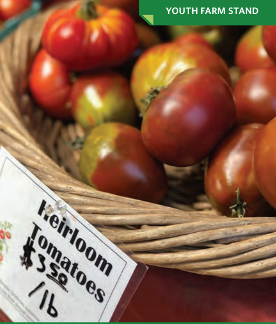
YOUTH FARM STAND

Receive email updates on how your support is making a difference in our community. Email development@foodforlanecounty.org and ask us to add your address to our email mailing list.