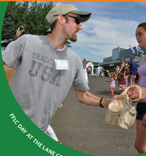
FFLC DAY AT THE LANE COUNTY FAIR

FRIDAY, OCTOBER 14 Empty Bowls Dinner & Auction at Bailey Hill Warehouse