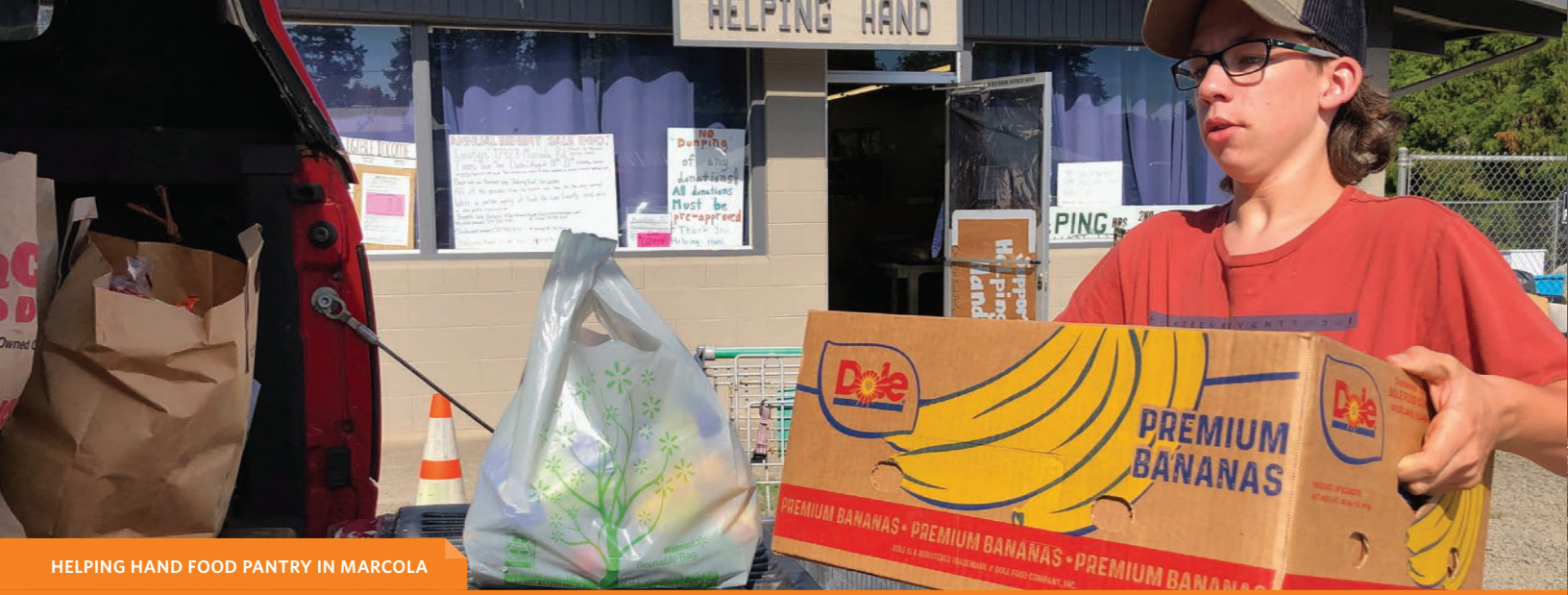
HELPING HAND FOOD PANTRY IN MARCOLA