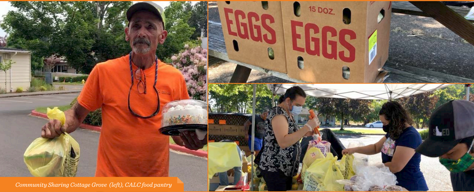
Community Sharing Cottage Grove (left), CALC food pantry