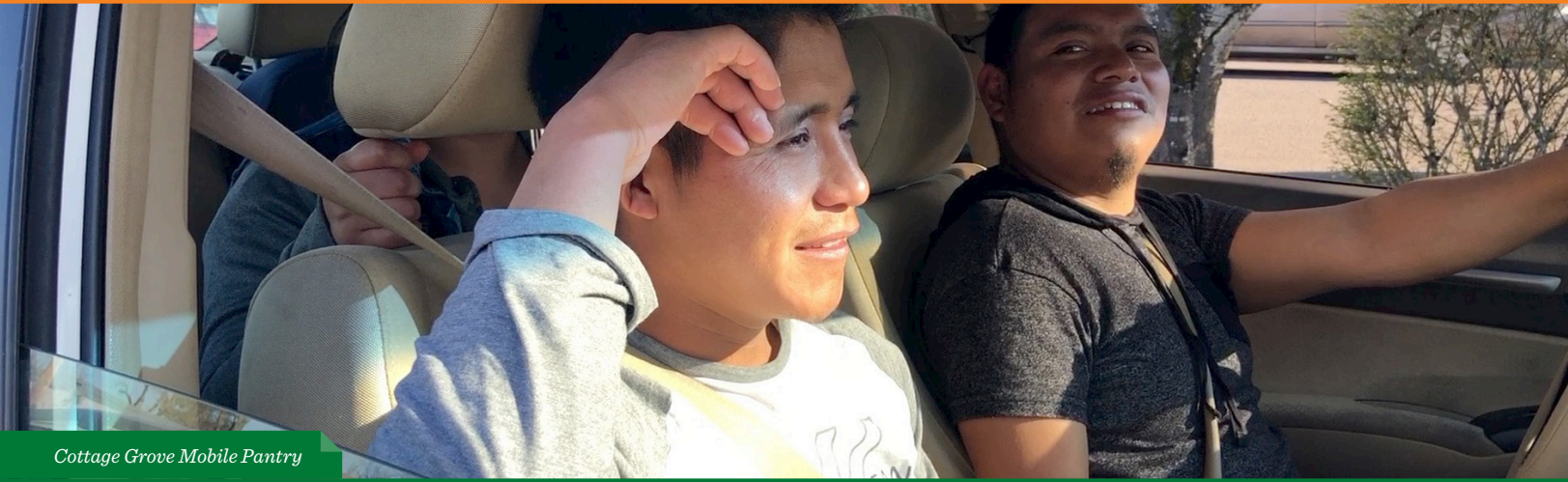
Cottage Grove Mobile Pantry

The end of the year is the perfect time to make the most of your charitable giving. With the passing of the CARES Act, additional charitable deduction provisions were added for 2020. Talk to your tax advisor, and consider the following ways you can help fight hunger in Lane County and realize year-end tax savings.