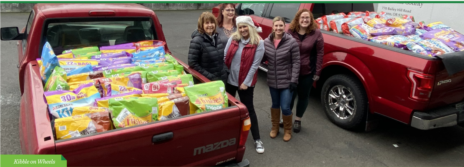
Kibble on Wheels