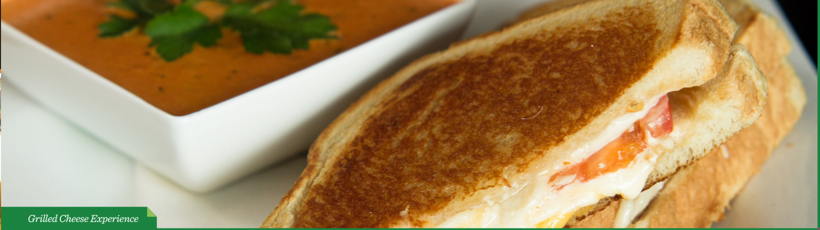
Grilled Cheese Experience

This is general information and not intended as investment advice. Please consult with a tax professional regarding your individual situation.