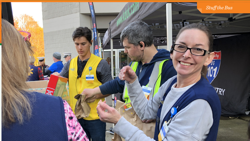
Stuff the Bus